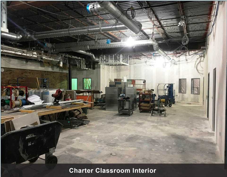
Charter Classroom Interior